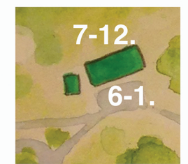
18. Smith Dorm