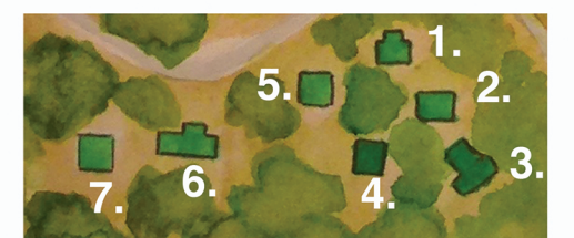
1. Fair Village Cabins