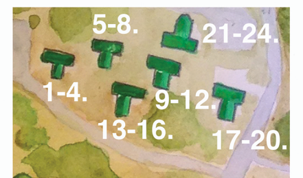
5. Family Life Center